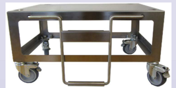
Option – mobile underframe TD 2000 44 x 53 x 32 cm (L x W x H)