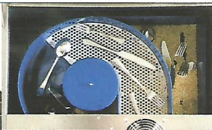
The cutlery is spirally transported upwards through a high-grade sterile granulate and is dried and polished. The installed ventilator prevents that granulate comes out of the machine.