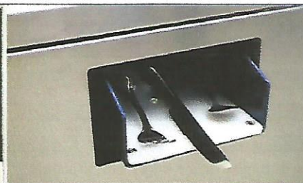
The regular use of TD 3000 L keeps your cutlery shining.