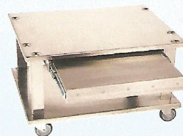
Option – mobile underframe TD 3000 L 52 x 67 x 36,5 cm (L x W x H)