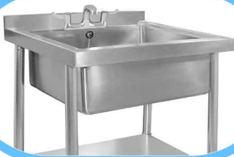
SMALL POTWASH SINKS