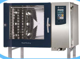
SMALL COMBI OVENS