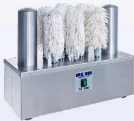
Glass Polishing Machine TD 1000