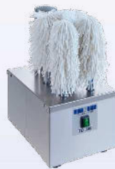
Glass Polishing Machine TD 500